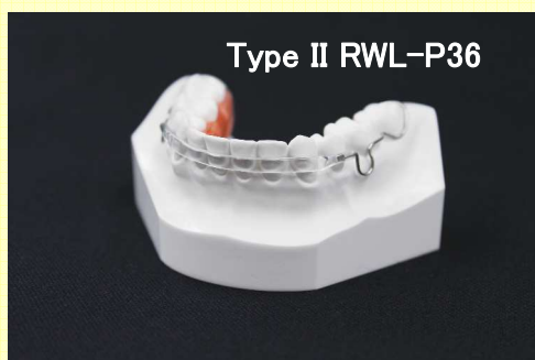
Type II RWL-P36