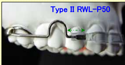
Type II RWL-P50

- Comparison Type I with Type II - (Extracted dental model is used)