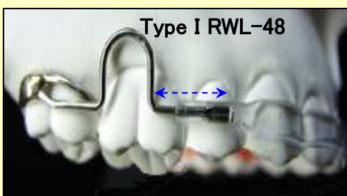
Type I RWL-48